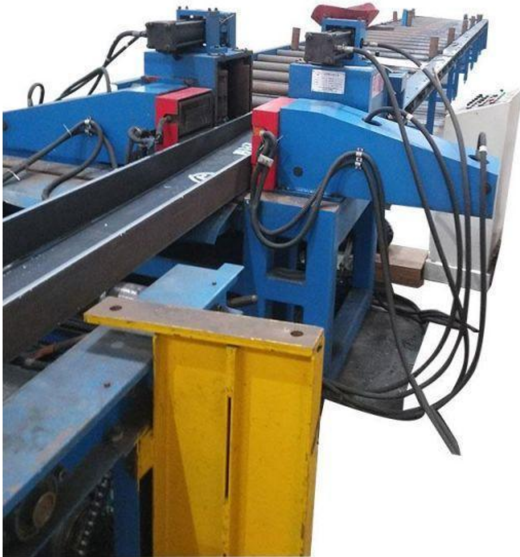
Assembling H beam in horizontal position

Ningbo JinFeng Welding and Cutting Machinery Manufacture Co., Ltd Address: No.337, 7th Xingci Road, Hangzhou Bay New Area, Ningbo, P.r.china Tel: +86-574-63487698 Phone: +86-13456194991