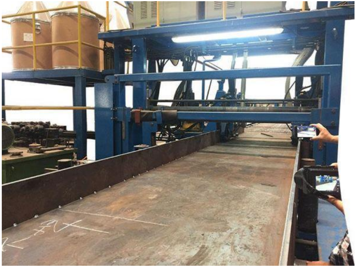
Welding H beam in horizontal position

Ningbo JinFeng Welding and Cutting Machinery Manufacture Co., Ltd Address: No.337, 7th Xingci Road, Hangzhou Bay New Area, Ningbo, P.r.china Tel: +86-574-63487698 Phone: +86-13456194991